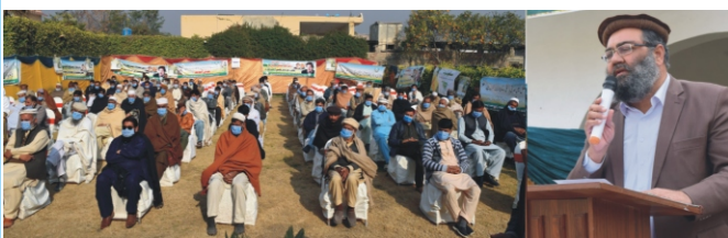
Mega farmer gathering at different districts of KPK

The main objective of the project is to enhance per acre wheat productivity to secure food security for the growing population in the province. Under this project 21563 MT certified seeds are provided to the farmers on subsidized rate, timely availability of 11760 bags of fertilizers (Phosphorous & Potash) to the farming community on subsidized rate is ensured and expansion in mechanized farming by providing 306 Nos. of different machineries is also Carried out.