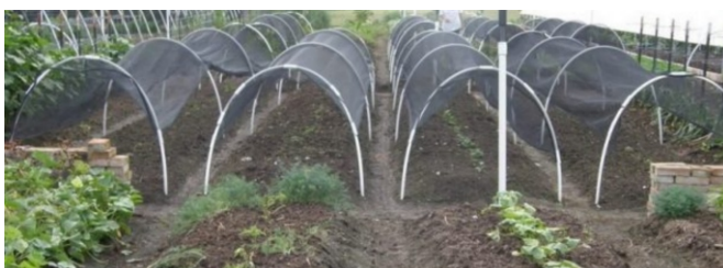
High tunnel farming of Tomato and Cucumber successfully initiated and launched in Village Buland Khel Upper Orakzai.

Agriculture Extension Merged areas laid out 980 acres of Fruit Orchards and distribute 27124 disease free fruit plants, Wheat seed distribution 8904 (acres), Maize seed distribution (acres) 4451, vegetable seed distribution (acres) 2763, Tunnel Installation/Demonstration (No's) 221, vertical net farming (acre) 70, Olive Grafting 55000, Demonstration plots in acres 6487 and total land reclaimed in acres 1281.